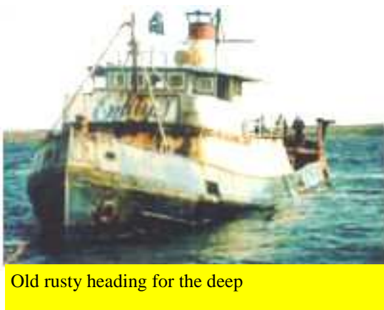
Old rusty heading for the deep